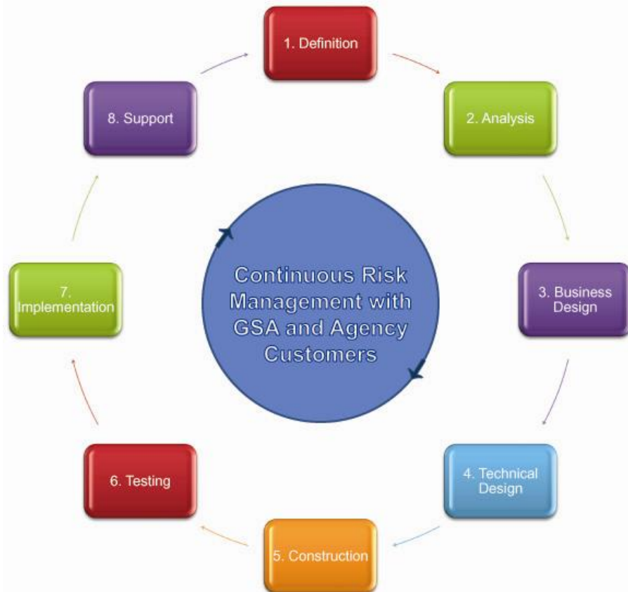
Figure EX-4: Level 3's repetitive transition process ensures smooth transition of services to Level 3's network