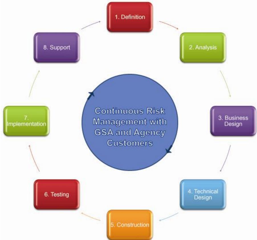
Figure EX-4: Level 3's repetitive transition process ensures smooth transition of services to Level 3's network